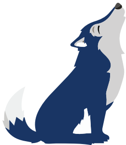
MCWHORTER ELEMENTARY SCHOOL

Muli is the only typeface assigned for use on the web. It is the default font on our website template and should never be changed without prior, written approval from the District Webmaster.