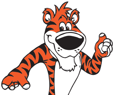
MCLAUGHLIN STRICKLAND ELEMENTARY SCHOOL

Muli is the only typeface assigned for use on the web. It is the default font on our website template and should never be changed without prior, written approval from the District Webmaster.