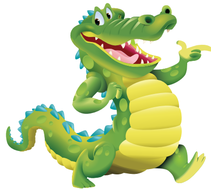
(Without school name)