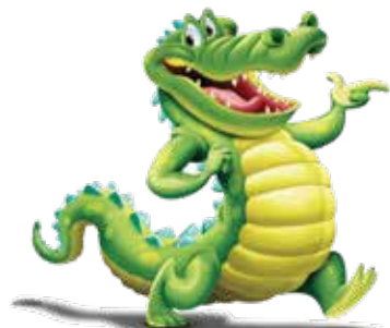
GOOD ELEMENTARY SCHOOL

Muli is the only typeface assigned for use on the web. It is the default font on our website template and should never be changed without prior, written approval from the District Webmaster.