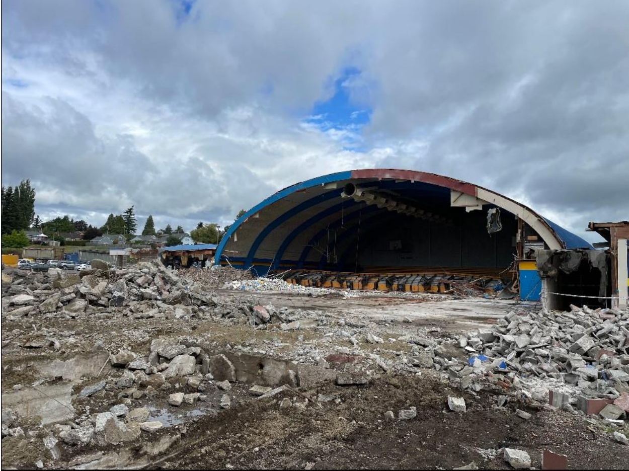
Demolition of the Old Gym is moving along very quickly