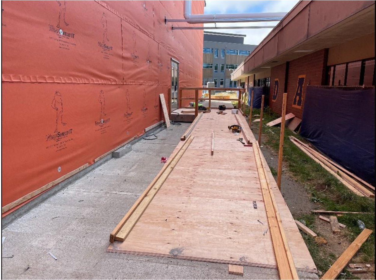
A temporary ramp is being built to allow full access to the new Athletic Wing