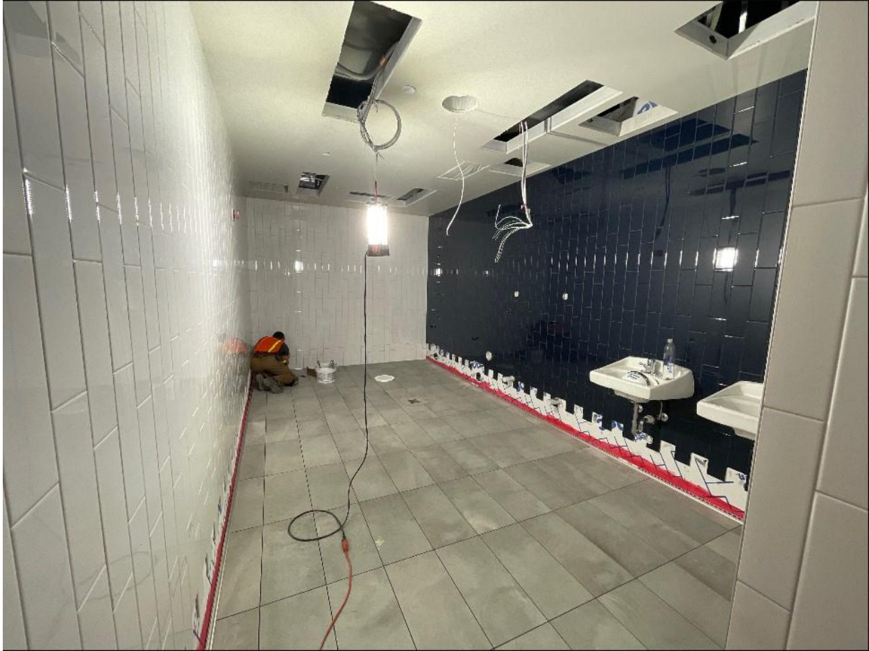
Bathroom tile installation in the Academic Wing