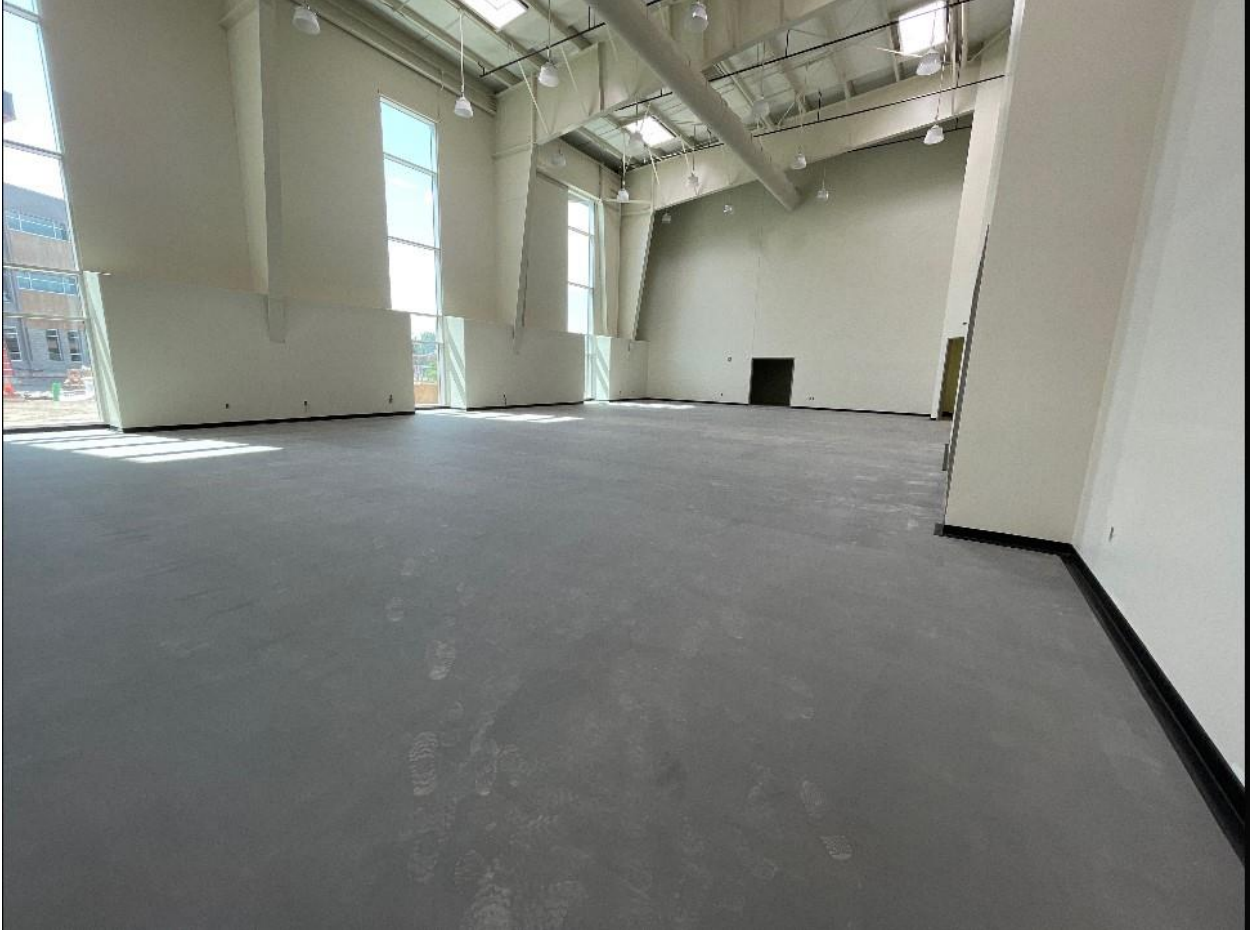
Installation of the new PE room's rubberized Mondo flooring