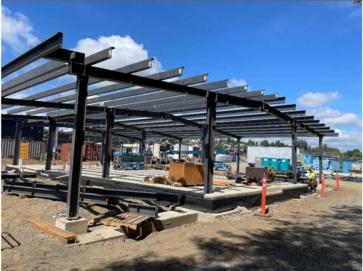
The metal framework for the Agriculture Science building went up this week