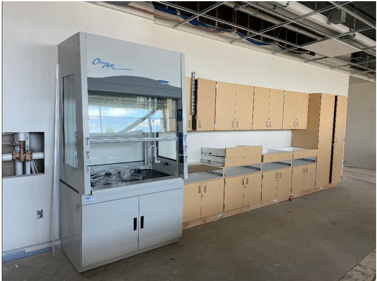
Fume hoods are being installed in the science labs