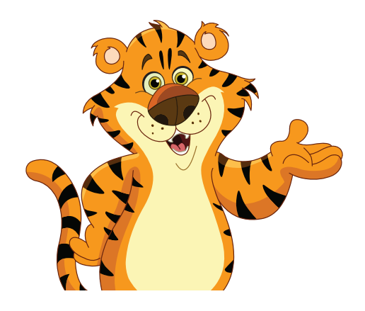
(Without school name)

School name spelled out in all caps Font: Century Gothic Regular Type minimum: 6pt