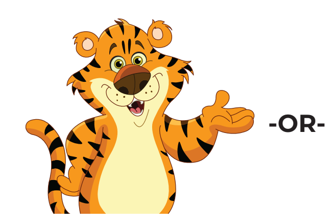
FREEMAN ELEMENTARY SCHOOL

School name spelled out in all caps Font: Century Gothic Regular Type minimum: 6pt