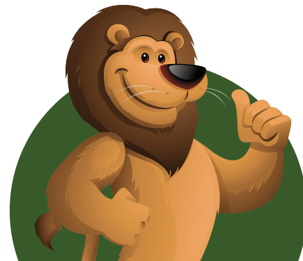
CARROLLTON ELEMENTARY SCHOOL