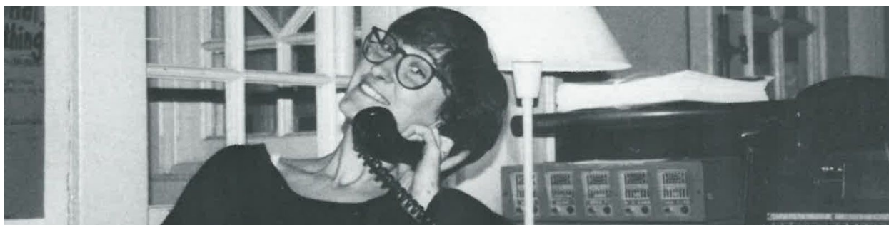
A student chats on the phone while working at the Bell Desk.