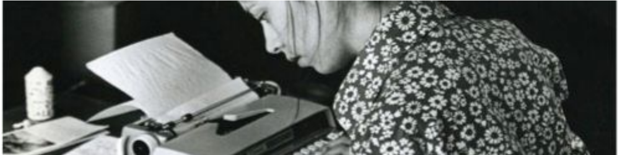
A student writes on a typewriter in Clapp Library.