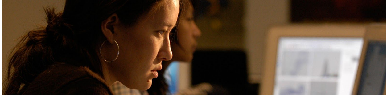
Students work on computers in the Media Arts and Sciences Lab in Jewett in 2005.