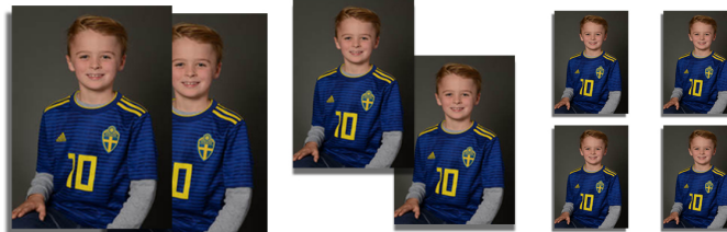
B $35 2- 5x7, 2- 3.5x5, 4 wallets