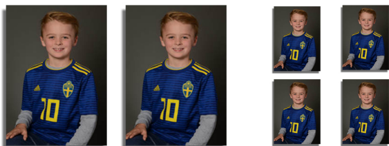
A $25 2- 5x7, 4 wallets