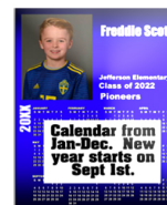
H $10 Calendar (8x10)