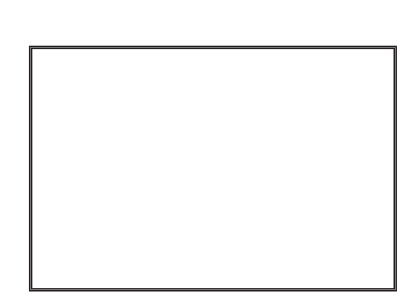
Half Page 5.5" x 4.25"