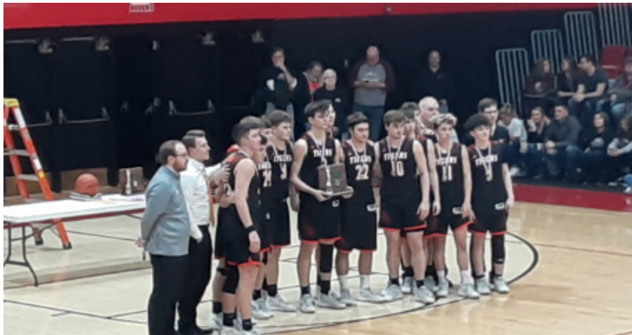
The Springfield Tigers holding their second place trophy.

This season for the Tigers has been awesome, don't you think?! The reason they played? They love basketball! Our overall record was 18-7. We have made a huge improvement from the beginning of the year to the end of the year. We did especially good since half of the team missed some of the practices and there was a delay to the start of the season due to how far the football team went in their season. The reason for this season was putting a smile on fans' faces. The Tigers certainly did that!! As you can see, this season has been awesome for the Tigers, and the reason they did it was pretty great as well!