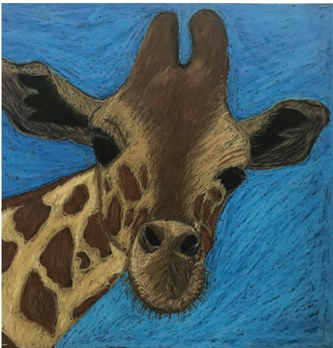
Grace, Grade 8, RAMS

I hope one day she spreads her wings and fly Fly to a place only she can reach