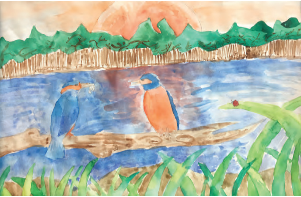
Summer, Grade 6, Brimhall Elementary