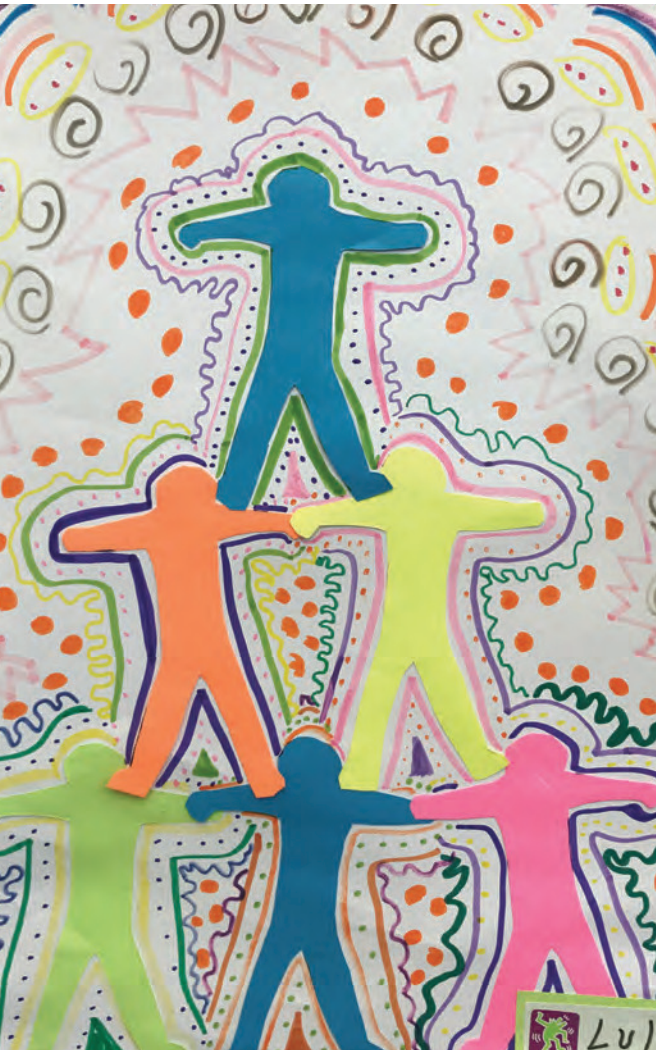
Lulu, Grade 3, Falcon Heights Elementary