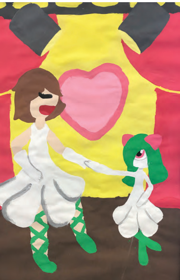
G, Grade 6, Brimhall Elementary