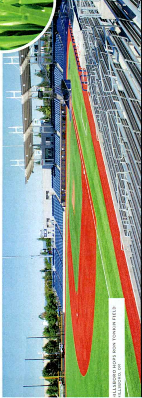
HILLSBORO HOPS RON TONKIN FIELD HILLSBORO, OR