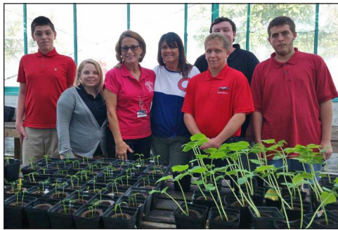
Collaboration with Atlantic high school.