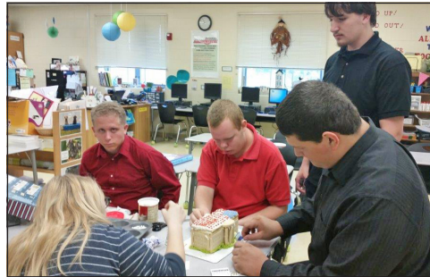
Cudas working with Sharks in the green house.