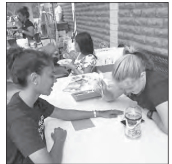
Henna Hand Painting