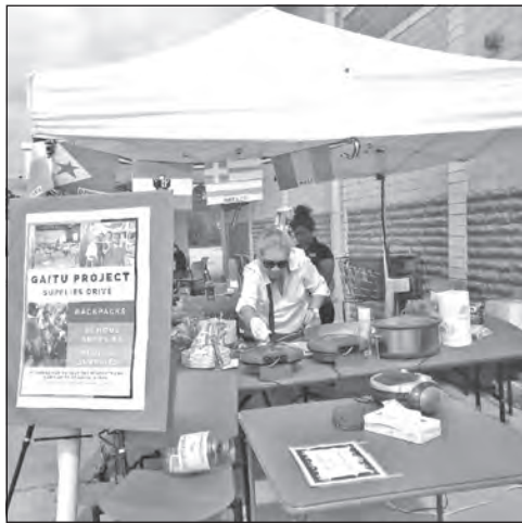
Gaitu Project - Supplies Drive