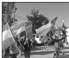
◀ Students of the International Club and the World Languages Department march in the Homecoming parade with flags of over 30 countries.

The World Languages Department and the International Club participated in Homecoming events. Many of the World language teachers, students and club members marched in the parade with over 30 flags from around the world. The club made a giant banner to hang in the doorway and decorated several doorways.