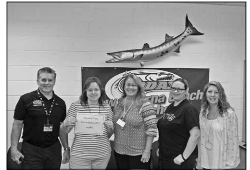
Pictured left to right: