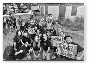
Cudas Choose Kindness participated in the annual homecoming parade with our very own float! We dressed up to the theme and spread positivity and school spirit!