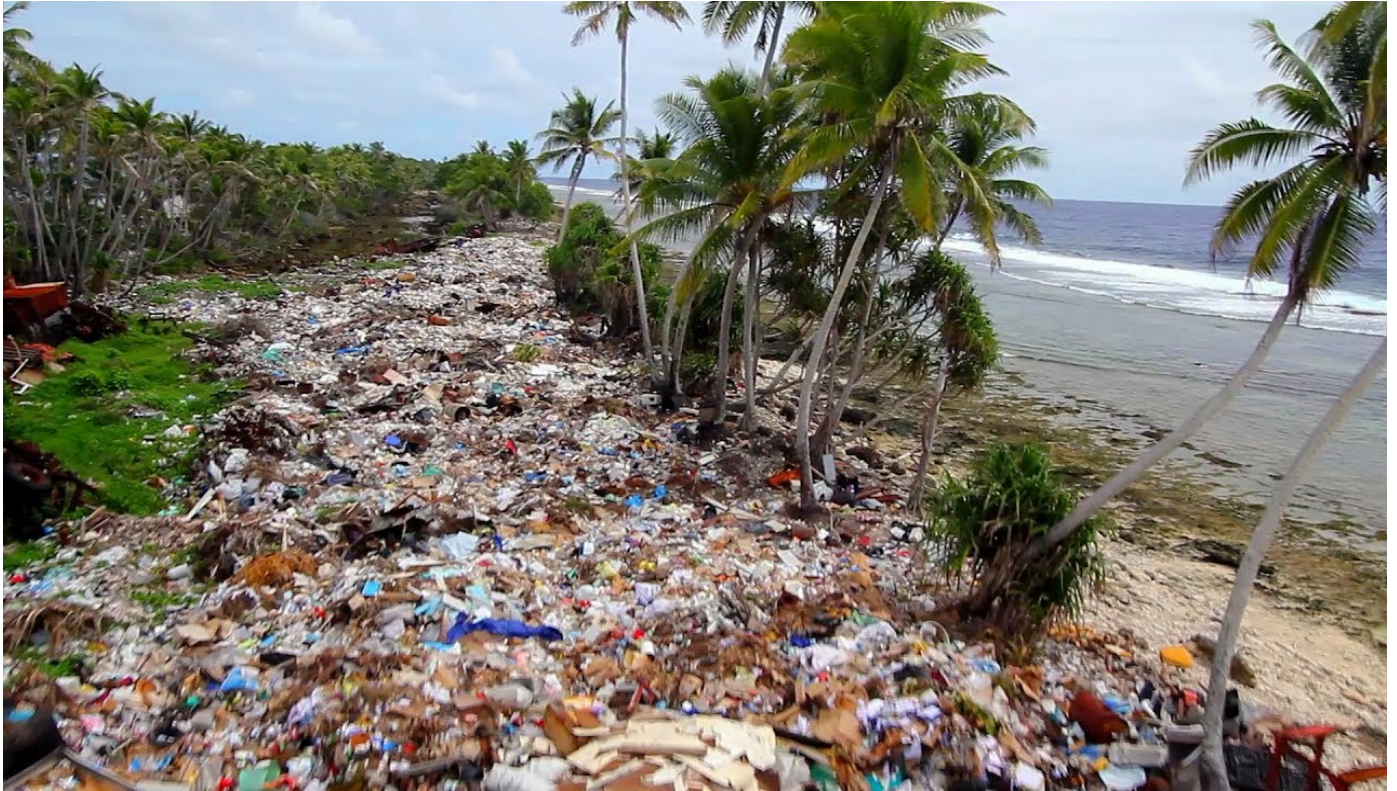
Resource D: The threat of plastic to marine life.