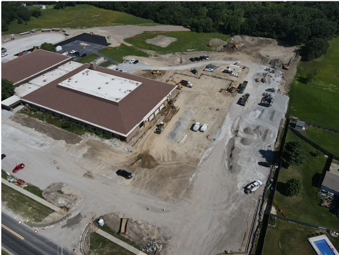
East Side Sitework