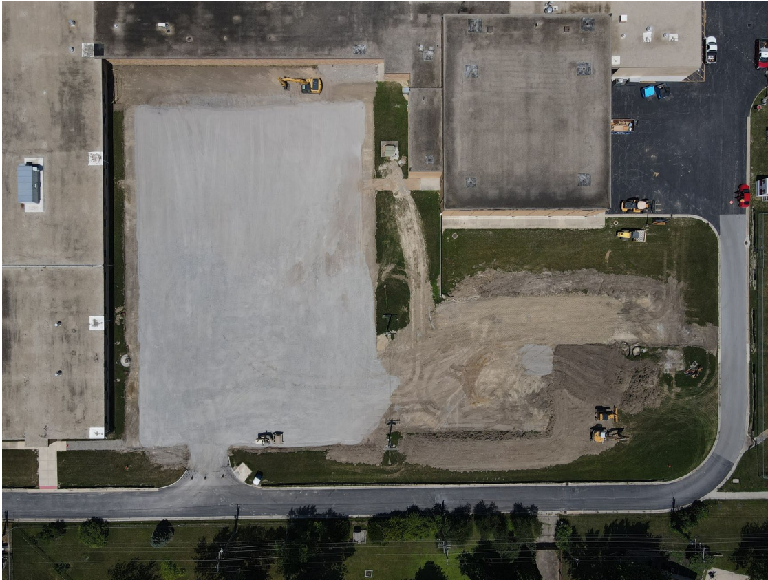
New Administration Building Pad