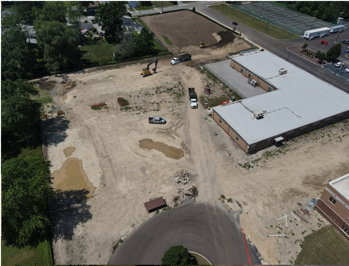
Auditorium Addition and West Pond