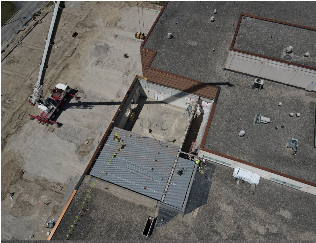
Roof Structure Removal