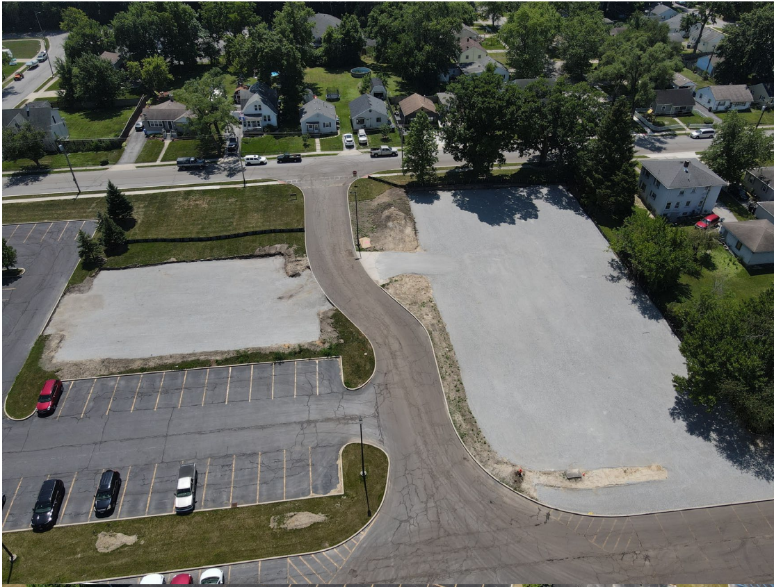
New South Parking Lots