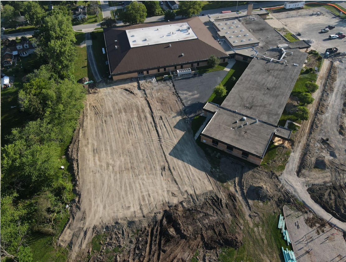
Classroom Addition Building Pad