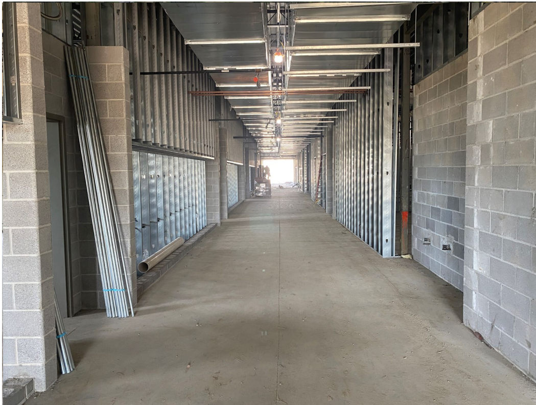
Academic Wing Hallway