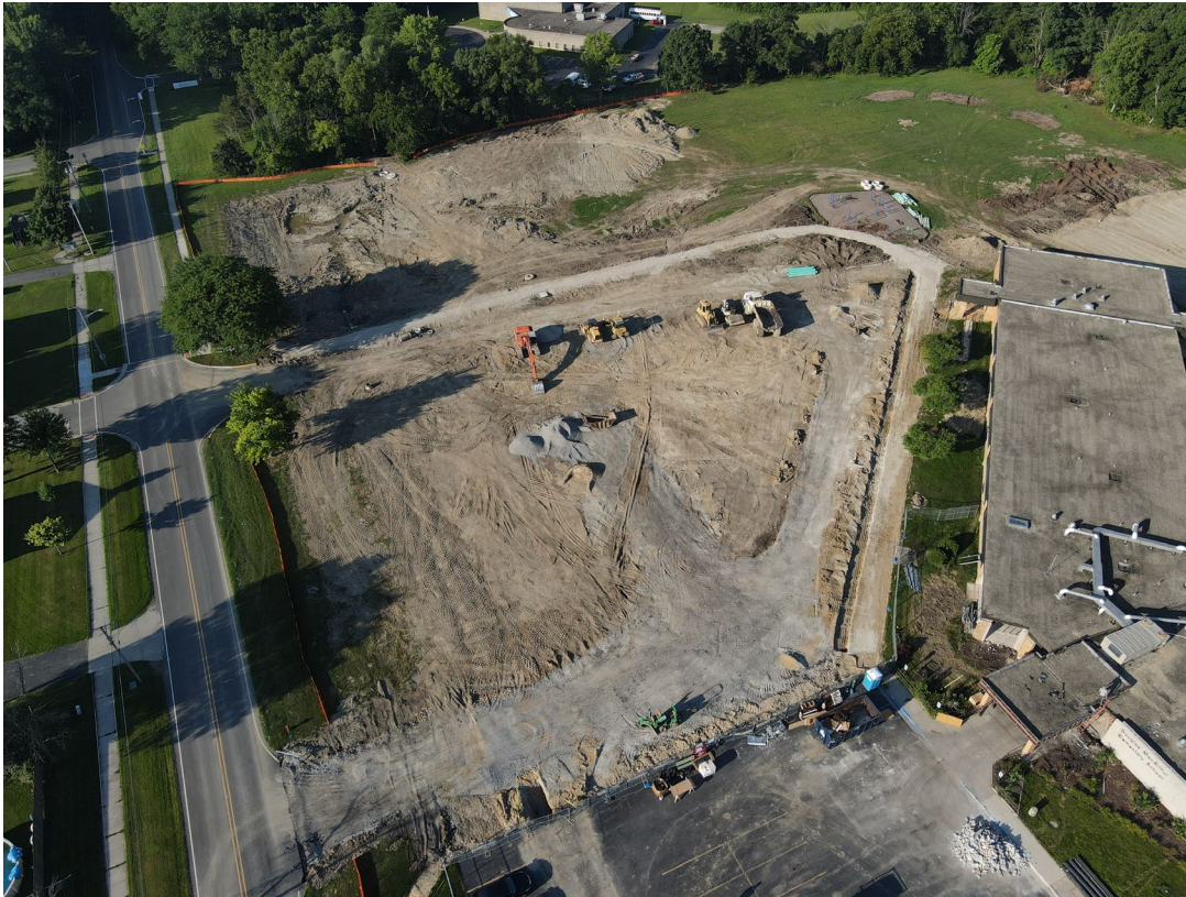
Southeast Parking Lot