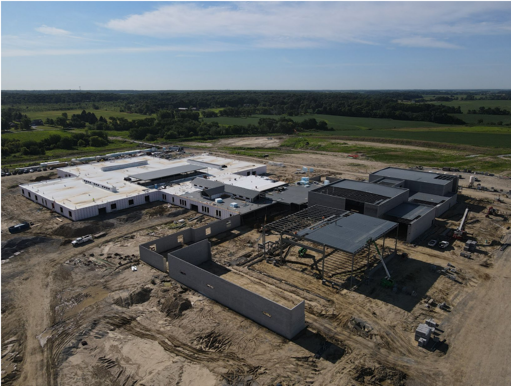
Auditorium Structural Steel