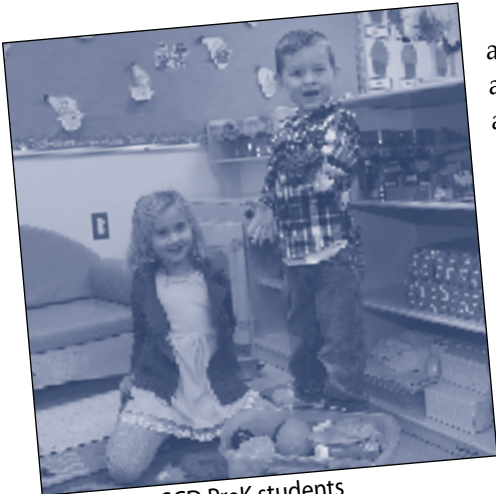
Saugerties SCD PreK students

Saugerties was awarded a second Expanded Pre-Kindergarten (Pre-K) grant in December. The grant will allow us to open two additional Pre-K classrooms in January 2019. Once they are added, we will have a total of five classrooms serving 80 four-year-old students.