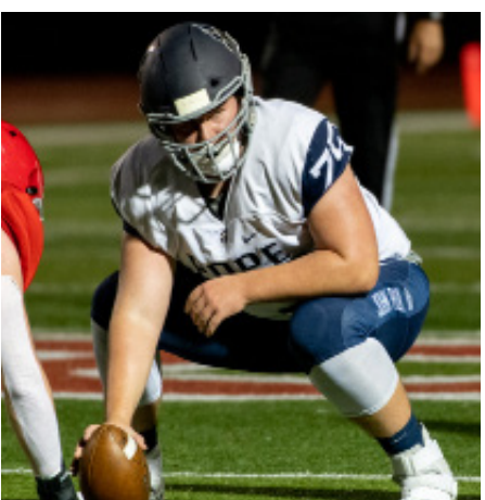
For more information and to purchase your subscription contact.... nfhsnetwork.com