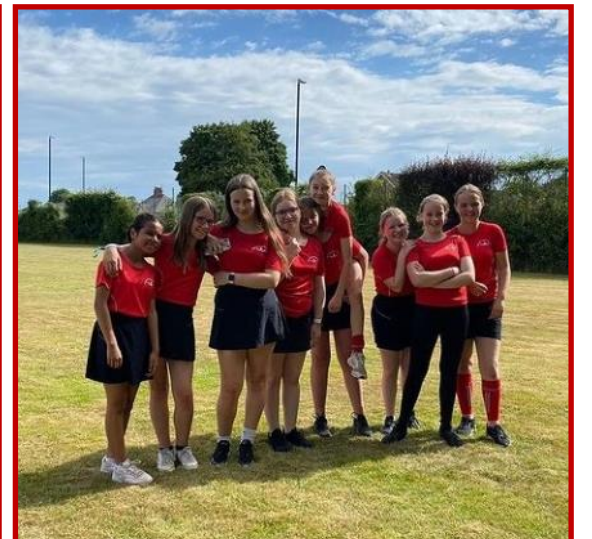
On Thursday 23rd June our Year 7 girls took part in the Annual Rounders Tournament at Alcester Grammar School