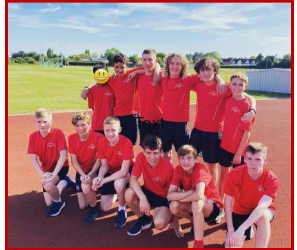
On Monday 20th June our Year 8 and 9 boys also took part in the Super 6 Athletics competition.