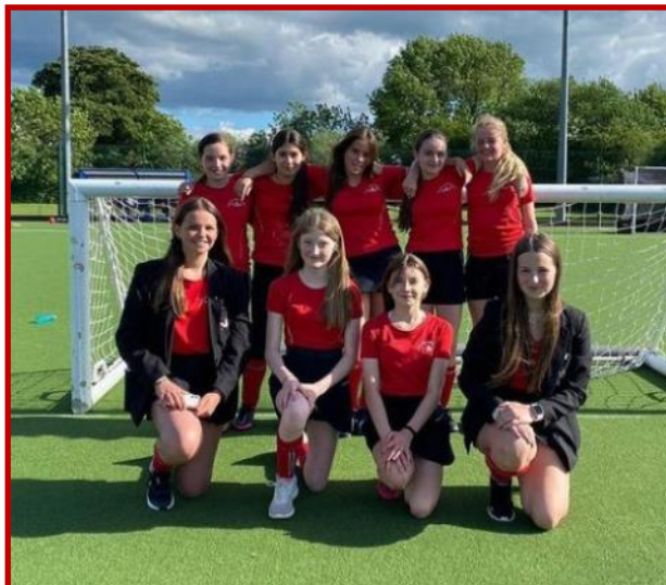
Our Year 7 and 8 girls football team played in the South Warwickshire School games competition held at Stratford School on Tuesday 24th May.