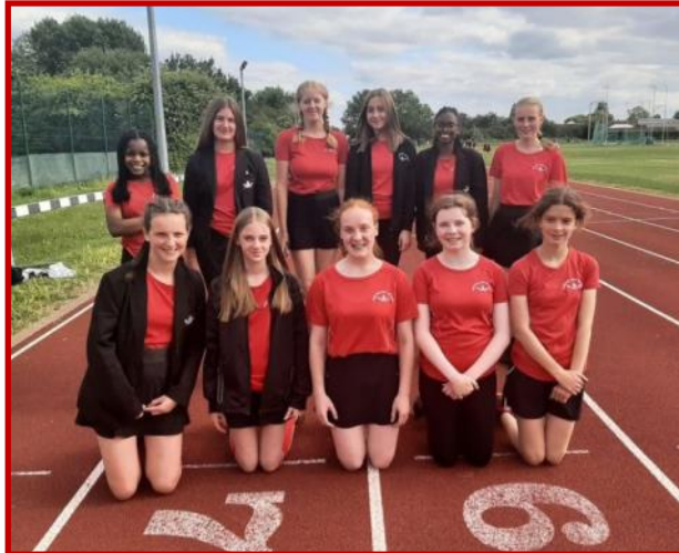
Well done to our Year 8 and 9 girls who took part in the Super 6 Athletics competition on Monday 13th June.