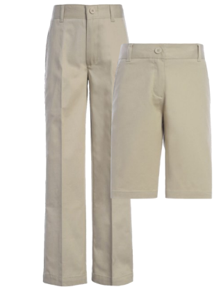
Flat Front Khaki Pant/Shorts