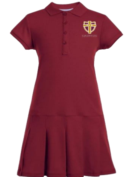
Polo Dress (BK - 2nd Only)