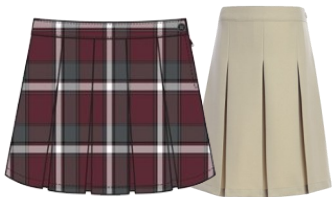
Box Pleat Skirt/Skort