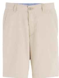
Performance Golf Shorts or Pants