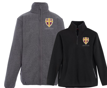
Full zip or 1/4 Zip Polar Fleece Jacket