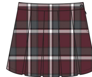
Plaid Skirt or Skort