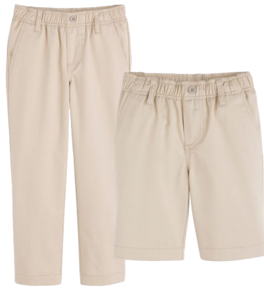
Pull on pants or shorts (BK - 1st grade only op-