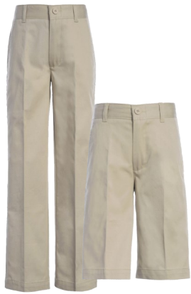
Flat Front Twill Blend or Cotton Pant or shorts