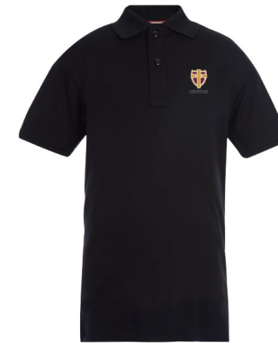
Black Polo Options: Dri-Fit (preferred) or Cotton