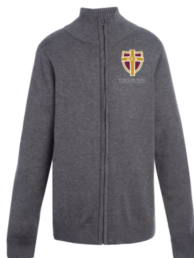
Long Sleeve Zip Sweater