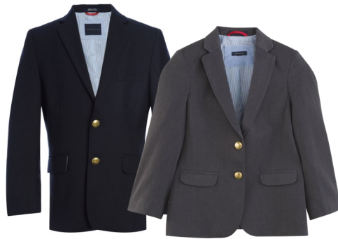
Blue Blazer - BK - 4th Gray Blazer - 5th - 8th Boys & Girls