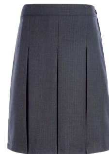
Gray Box Pleat Skirt