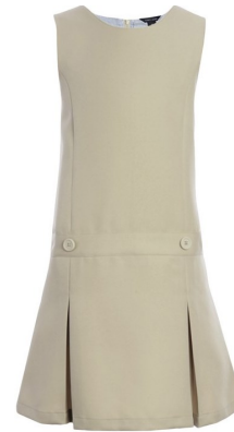
Khaki Jumper (BK - 3rd Only)