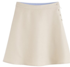
Side Button Skirt/ Skort