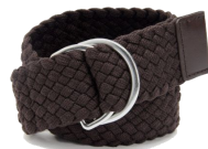
Brown or black belt