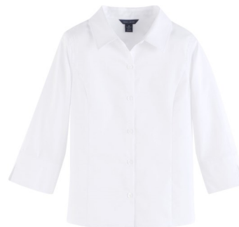
3/4 Sleeve Oxford Blouse