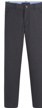
Herringbone Flat Dress Front Pant