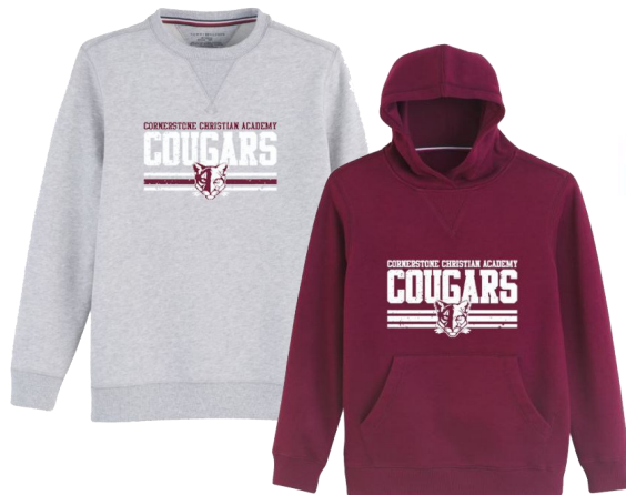
Crew or Hoodie Sweatshirt