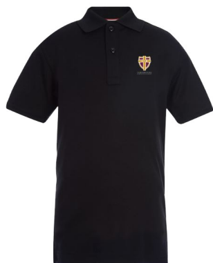
Black Polo Options: Dri-Fit or Cotton