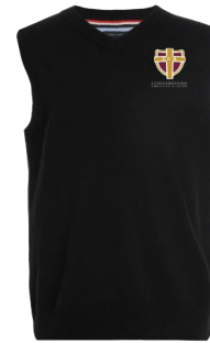
V-Neck Sweater Vest Unisex