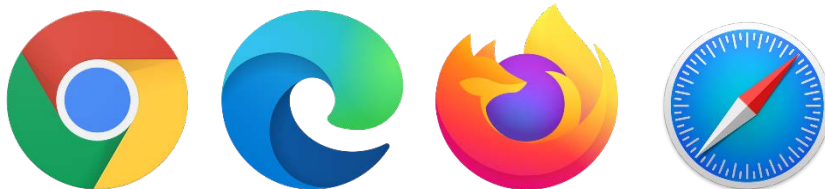
Chrome Edge Firefox Safari