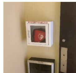
Complex AED Location