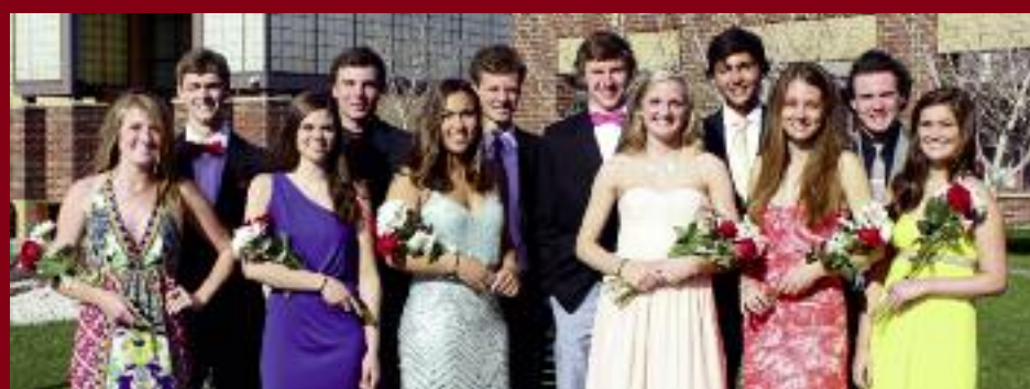
2014 Prom Court