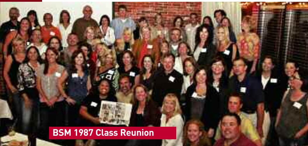
BSM 1987 Class Reunion