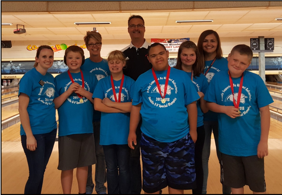
The annual Special Olympics Bowling Competition for Dunklin R-5 students took place on October 9th at Quonset Lanes. All students placed 1st, 2nd or 3rd.