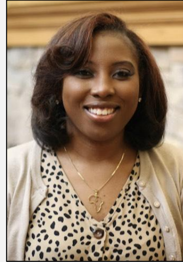
Tanzania Green tgreen