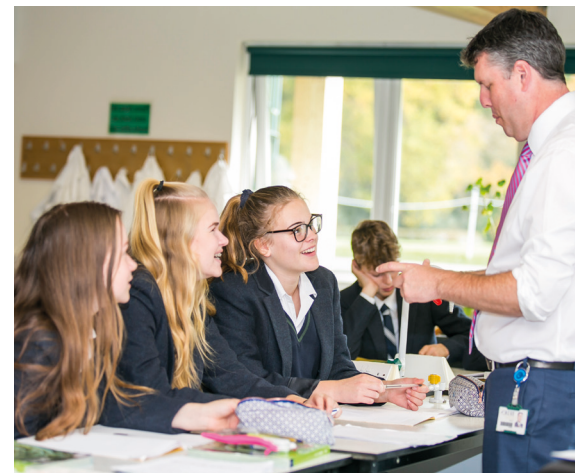
Bede's First Year 2023-24