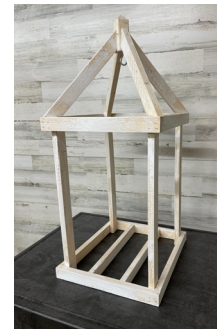
Large Lantern Class