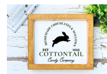
Spring Easter Sign Class