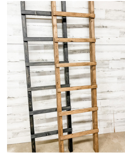
Blanket Ladder Class