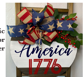
Patriotic Door Hanger