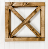
Rustic Wreath Hanger Class