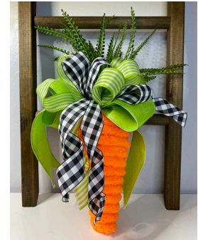
Hop to It Class