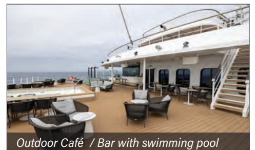
Outdoor Café / Bar with swimming pool

Currently under construction in Finland and launching in July 2022, Swan Hellenic's Vega is a new-generation expedition cruise ship. Although at 10,250 tons the ship is large enough to accommodate more than 250 passengers, Vega will accommodate a maximum of 152 guests in 76 spacious staterooms and balcony suites. The low guest density results in one of the most generous indoor and outdoor space-to-guest ratios among cruise ships.