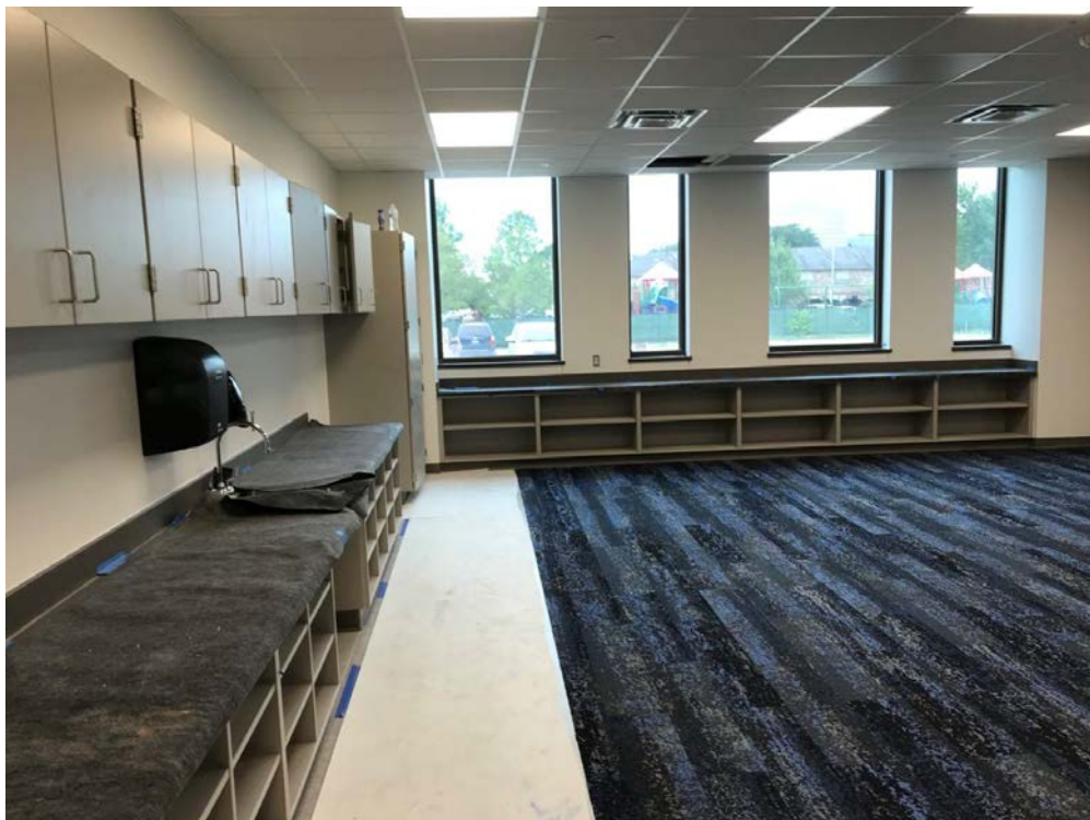
Classroom Teaching Wall