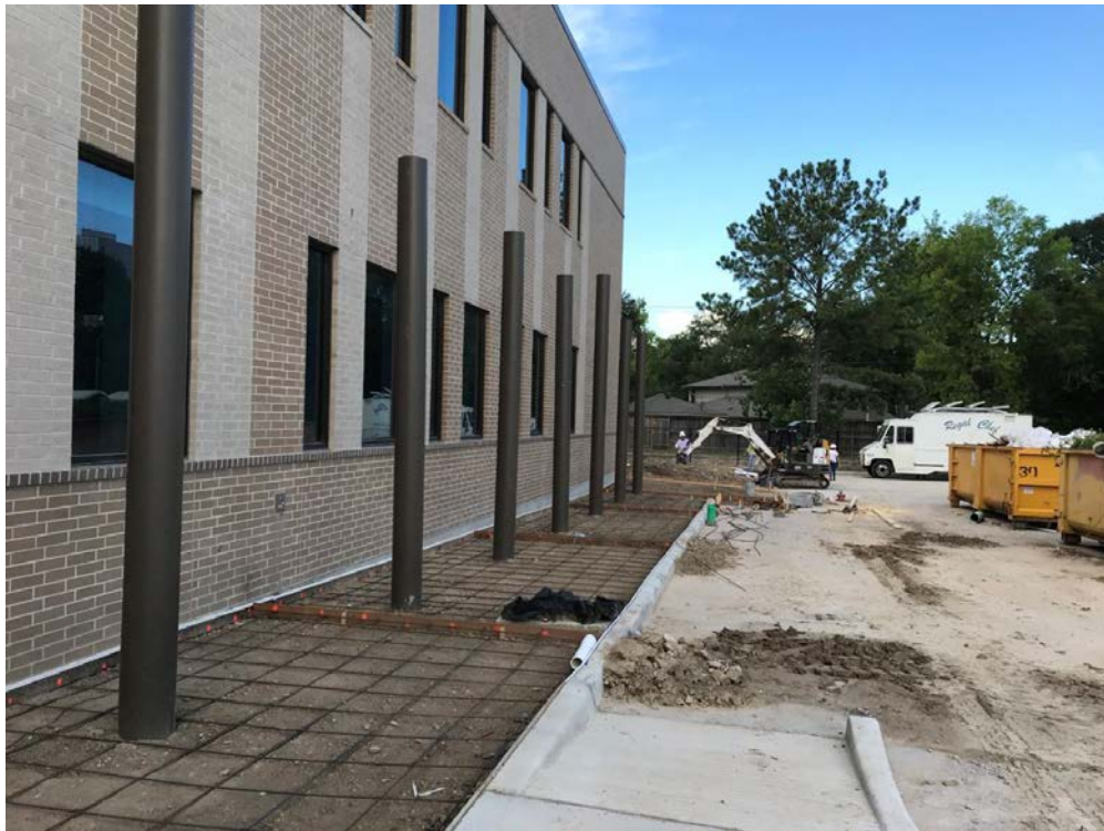
Learning Plaza Covered Area