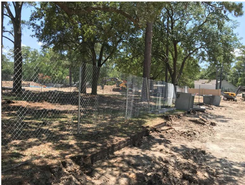
City of Bunker Hill Village Water Well