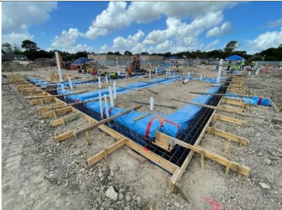
Reinforcement steel and vapor barriers for grade beams Area C & D