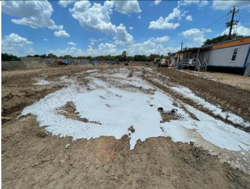
Hydrated Lime stabilization