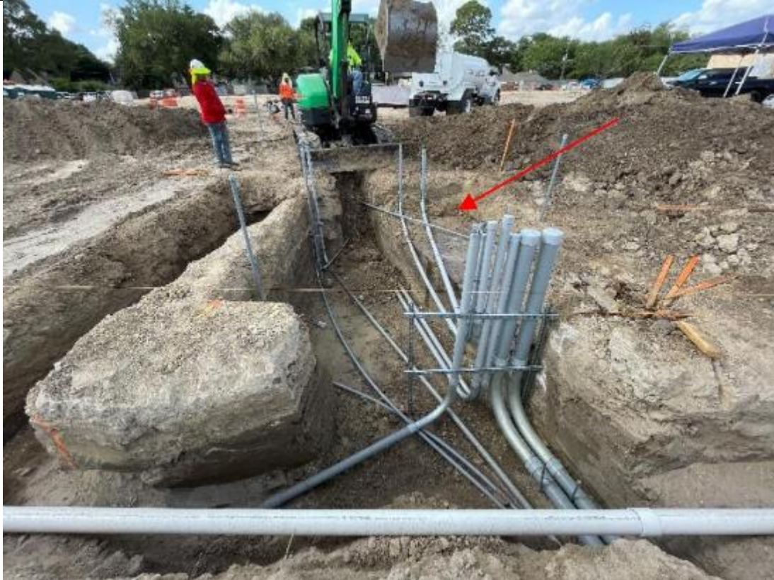
Underground electrical. Area C