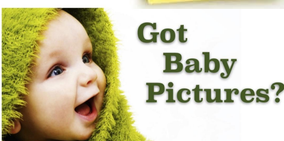
Attention 8th Grade Parents:

The Yearbook staff is collecting baby pictures for this year's publication. If you have a digital copy, please email it to: kimber1572@gmail.com and if you have a photo that needs to be scanned, just drop off the photo at the office and make sure that the students name is included with the photo. We will return it to you as soon as we have scanned the image and uploaded it to the publication.