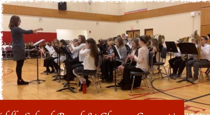
Middle School Band & Chorus Concert