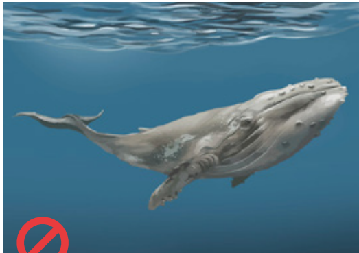
Less than 2000px in the widest edge