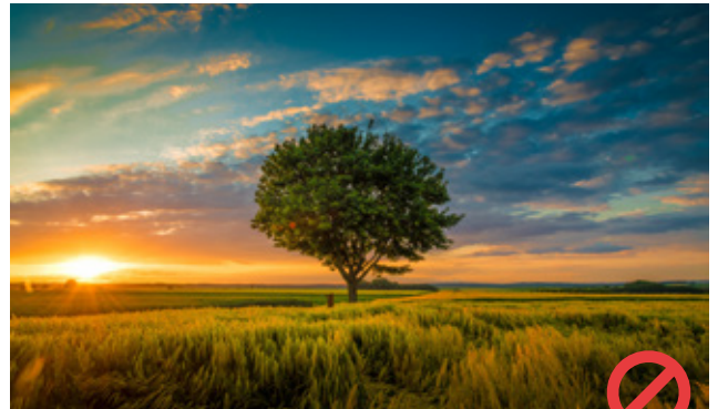
Use google/stock images