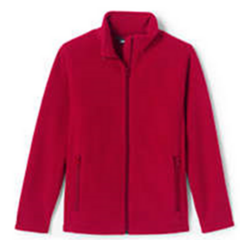
(OPTIONAL) RED FLEECE JACKET WITH LOGO