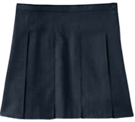
NAVY SKIRT OR SKORT OPTION