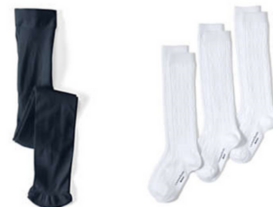
NAVY, RED, WHITE OR BLACK TIGHTS OR SOCKS