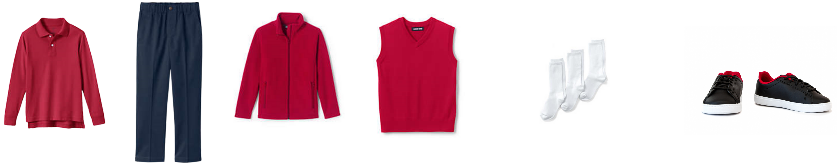
RED LONG SLEEVE POLO SHIRT WITH LOGO NAVY PULL ON PANT