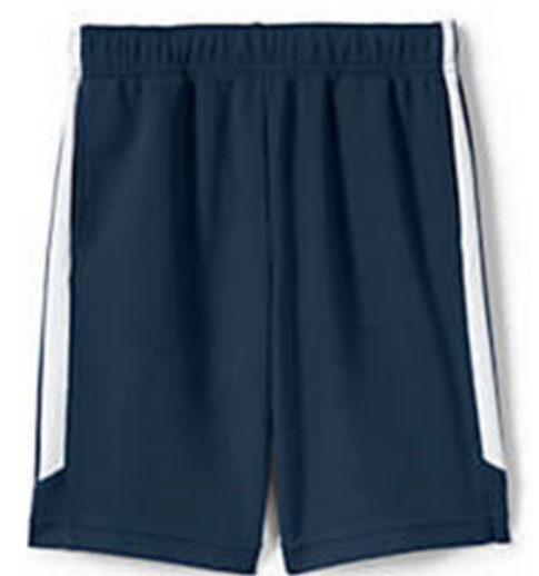
NAVY TRACK JACKET, NAVY TRACK SHORTS OR PANTS