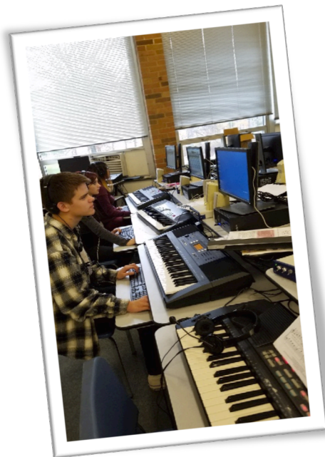
Students using the Pro Tools recording software in the newly update music technology lab at the Butler Senior High School

We followed up the performances with pizza, some bonding time, and finally some Christmas caroling. Senior high students "adopted" a sixth grader, and vice-versa. It was a fun event, and we hope to see these 6 th grade singers all back in choir next year when they attend Butler Intermediate School! These groups are performing on December 14 (SHS) and 21 (6 th grade).