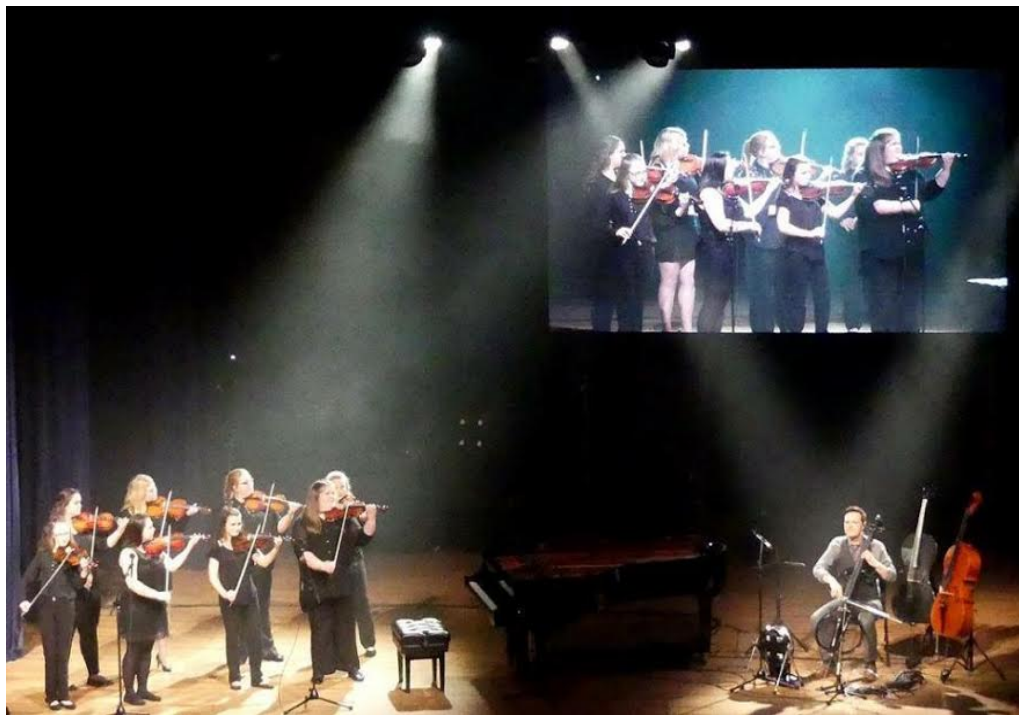
BUTLER ORCHESTRA STUDENTS PERFORM WITH "THE PIANO GUYS"