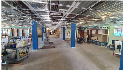
IMC is starting to take shape!

Phase one of the renovations are on schedule to be complete at the end of this month. The IMC continues to take shape with a makerspace and reading nook. The music room has new flooring and a fresh coat of paint. New windows are also being installed and will continue to bring in a great deal of natural light for students.