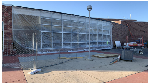
The exterior is finishing up with new windows and sidewalks.

Renovations will be complete this month and ready for when students come back to school. As part of this work, we were able to expand the cafeteria and server space which not only will provide more space for students but will also allow for a better flow during lunch periods.