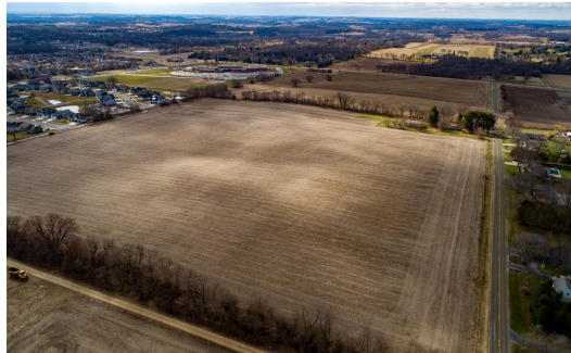
Top: drone image of new school site Bottom: rendering of GDS addition