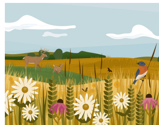
Preview of imagery that will be on the walls of the new school