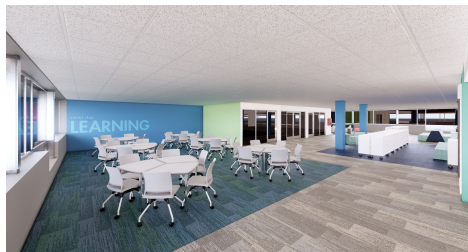
Rendering of new Winnequah library

Glacial Drumlin: The design for Glacial Drumlin School includes a newly constructed addition to the cafeteria. This expansion will increase seating and create a second serving area with multiple lines. These additional serving lines, better queuing and more seating will improve lunchtime and allow students to spend less time in the lunch line and have more time for eating and socializing. This addition is being planned for summer 2020, pending approval by the Village of Cottage Grove.