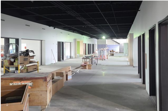
Area A Level 1