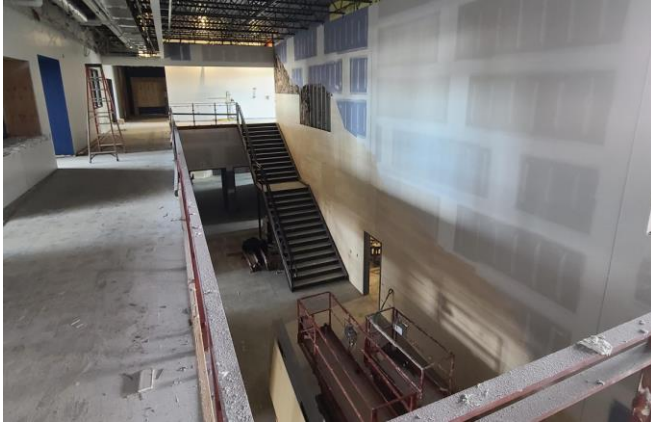
Area C Main Stair