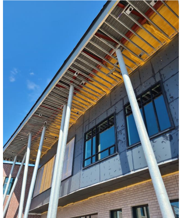
Light Fixtures at Main Entrance