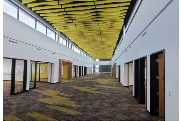
Area B Level 2