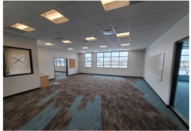
Area A Level 2 Classroom