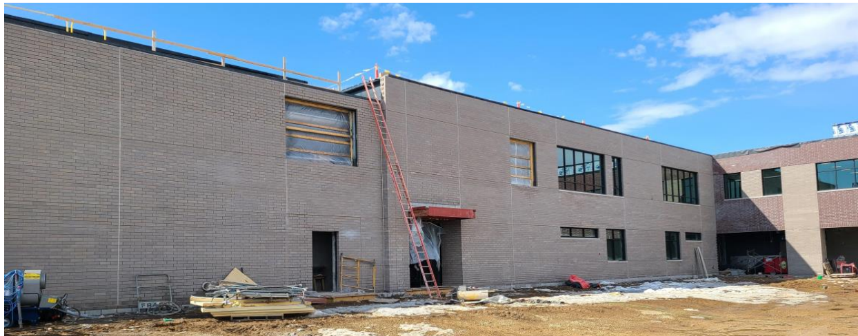
Area C East Side