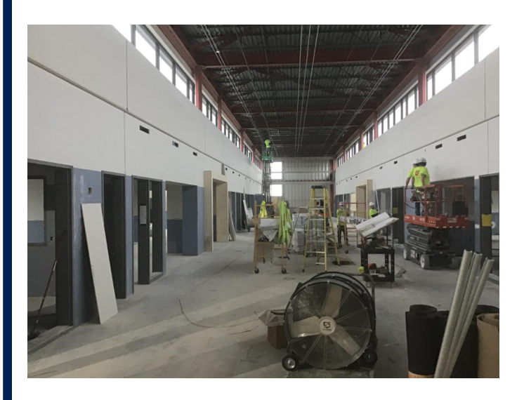
Level 2 Area B drywall installation.