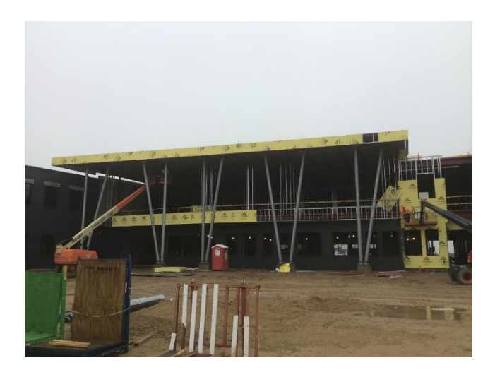
Entryway Canopy studs and sheathing.