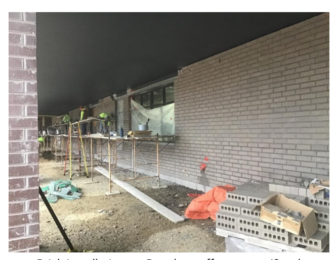
Brick Installation on Bus drop off entryway (South side of Area B).