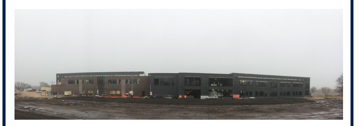
Brick and precast installation on the Flex Cafés beginning and AVB detailing complete on North side of Area A.