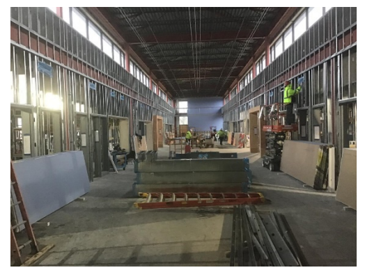
Level 2 Area A walls framed and MEPs in.