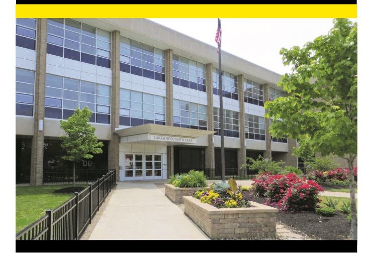
Visit us at: www.lakewoodcityschools.org/westshore

www.lakewoodcityschools.org/westshore Or apply today at: http://tinyurl.com/wsapply