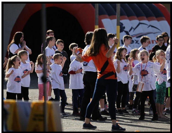
Students and leader getting charged up for the Fun Run.