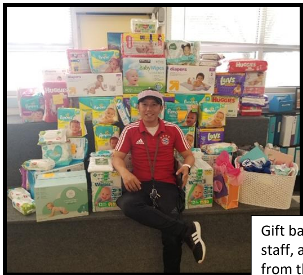
Gift basket from the staff, and tons of diapers from the families.

Our Fun Run was a success, both with the students having a great time over the two week period, as well as the Run. Our campus also brought in more funds that the previous year!