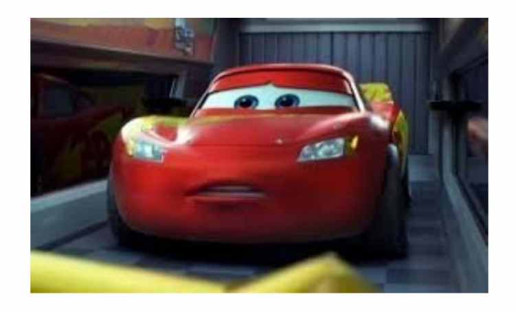
I feel safe!