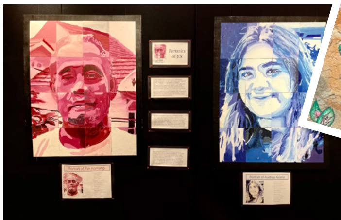
Portrait of JIS by Grade 6 students

JIS Grade 6, 7, and 8 students created portraits, drawings, reduction prints, and drypoint prints as part of their visual arts class exhibition. Their thought-provoking works of art in the Middle School Art of the Dragons Gallery were displayed across the MS campus.