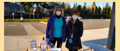
School nurses conduct a health check on each child before entering the childcare program.

More than 60 days of FREE childcare for children of first responders and healthcare workers.