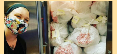
This is one of our many heroes packing meal kits in an effort to feed all kids.

More than 400,000 FREE meals served to ALL children (no matter their family's financial status) ages 1 to 18.