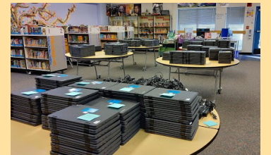
Tech teams stack Chromebooks in preparation for a social distancing pick up for K-6th grade families.

300 hotspots (devices that provide free wifi) deployed to families.