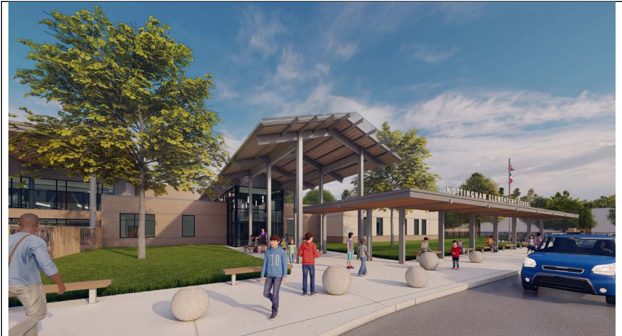
Most up to date rendering of main entry. Image presented during Design updates review.