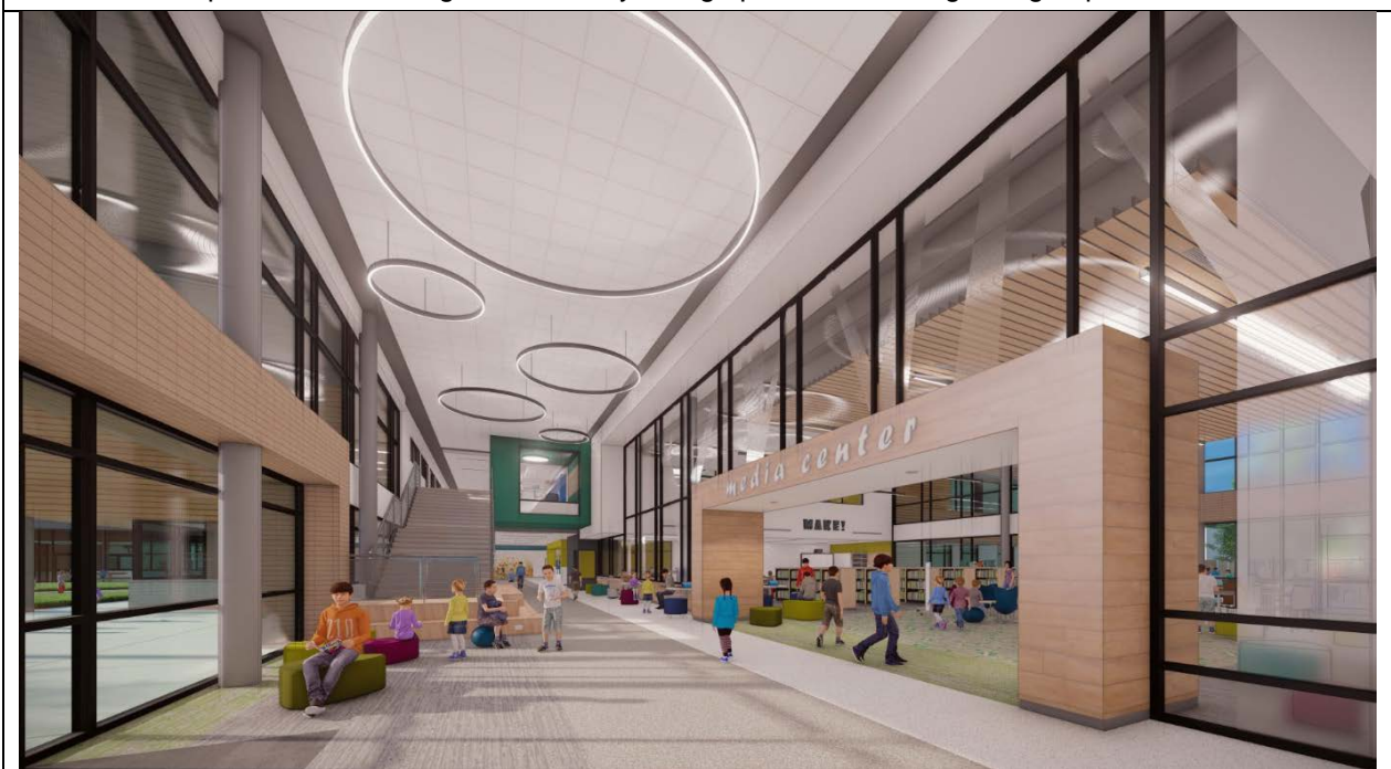
Concept image of the main corridor. Image presented during Design updates review.