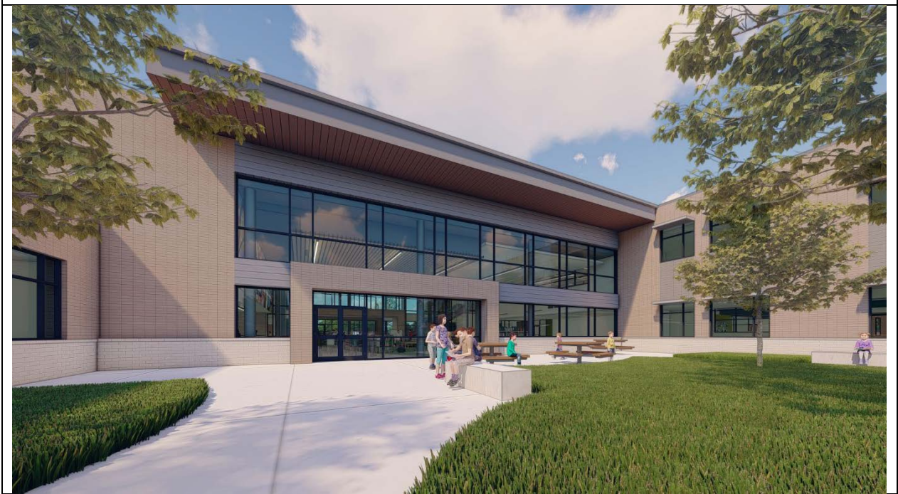
Concept image of the Library exterior. Image presented during Design updates review.